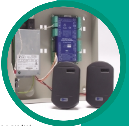
21592 - Expansion Kit

This feature allows the hardware to be installed without needing to set any dip switches or addresses. With the EasiNet PC software the installer can simply identify all hardware available on the network; the software allows the installer to easily configure it.