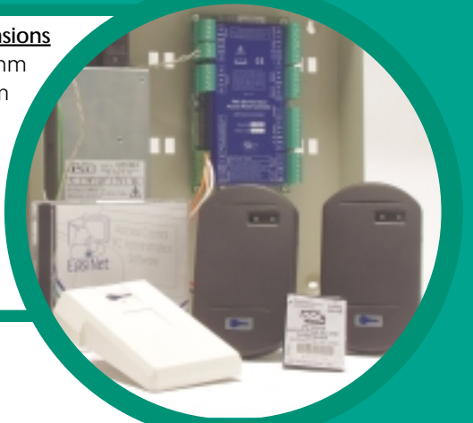
21591 - Starter kit

21053 - PAC 202 Two Door Access Controller (unboxed)